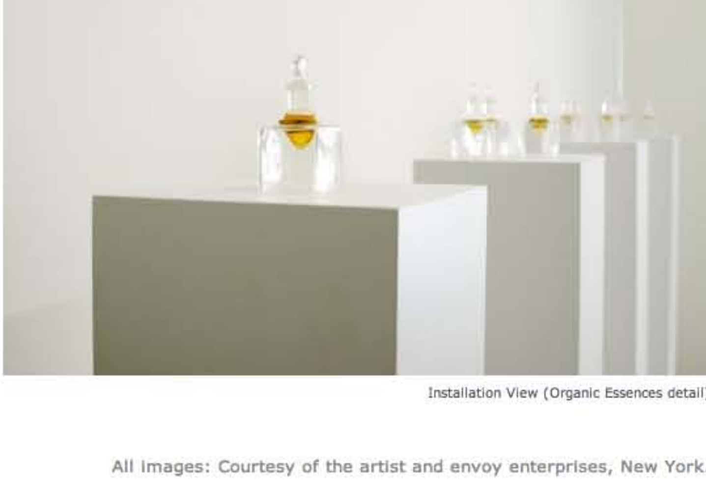
Installation View (Organic Essences detail)