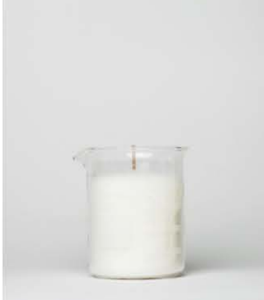
Martynka Candle 1 (C1), 2012 scraped off body on 05.20.12 paraffin, stearic acid, sweat essence, wick, beaker 3 1/2 x 2 1/2 x 2 1/2 inches