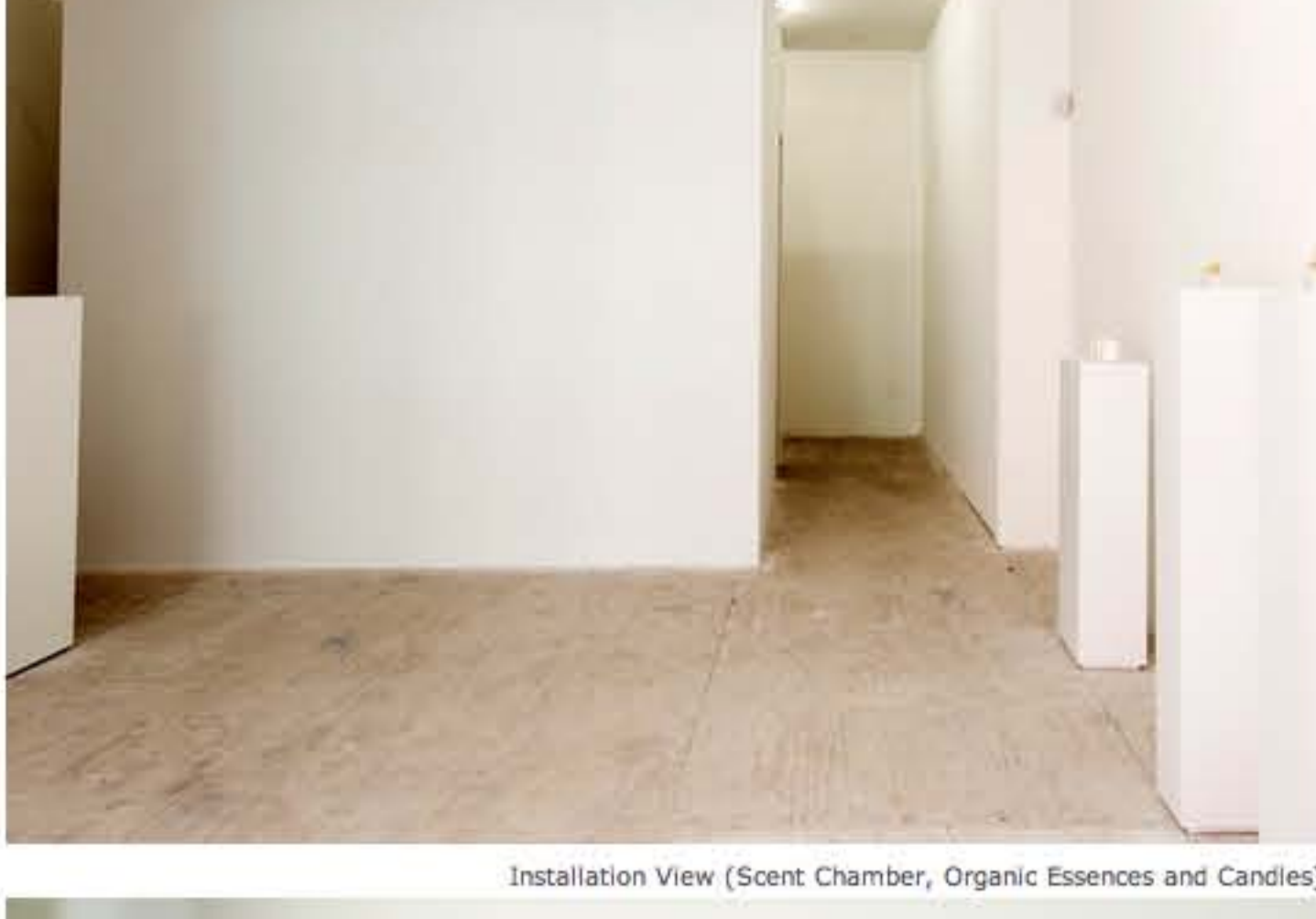
Installation View (Scent Chamber, Organic Essences and Candles)