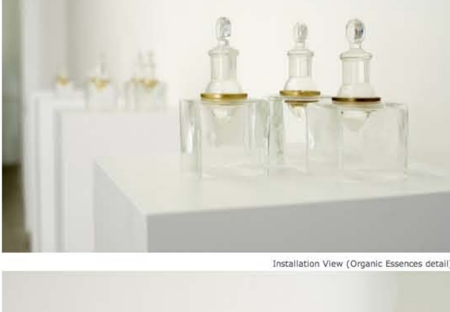
Installation View (Organic Essences detail)