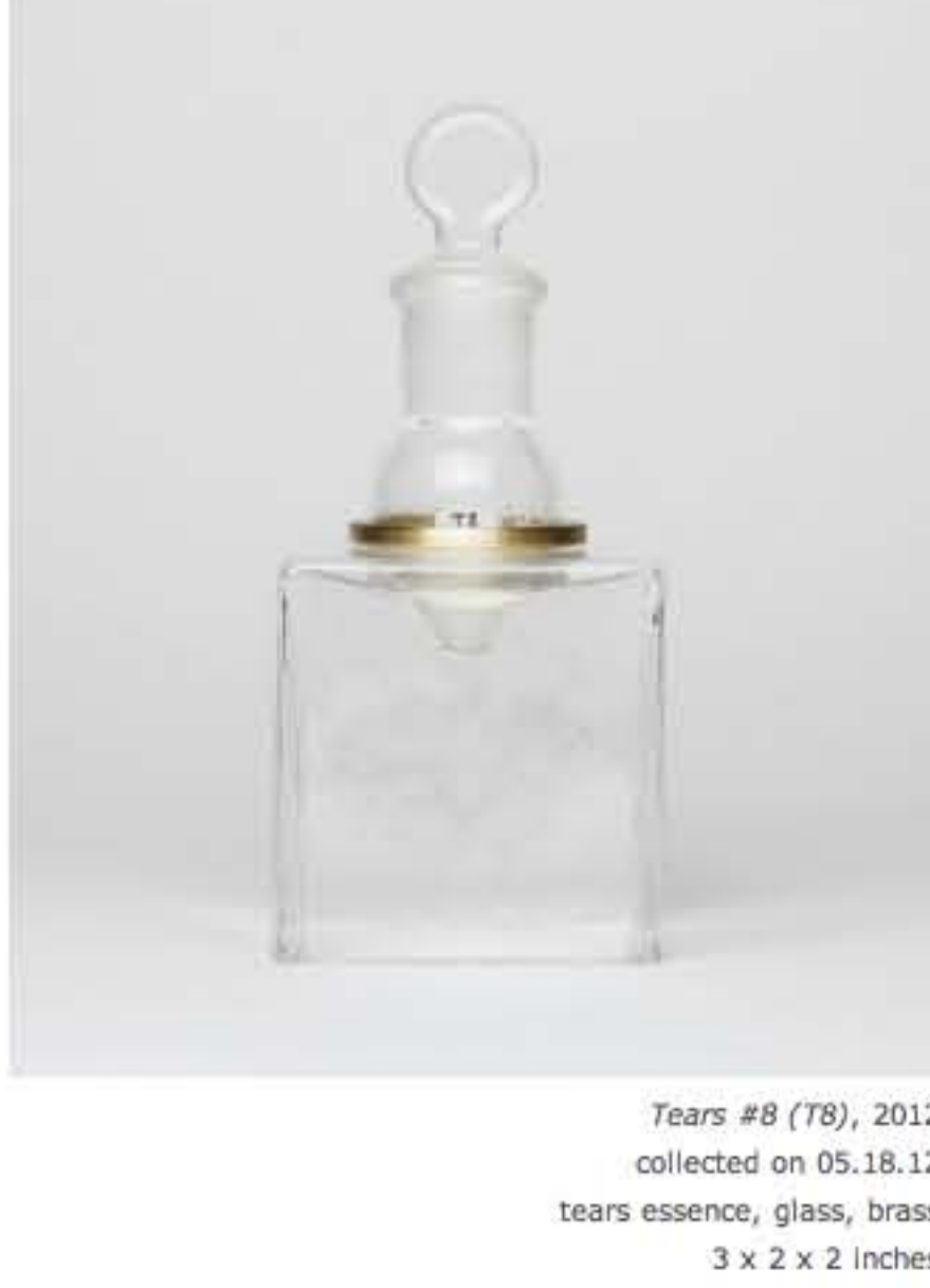
Tears #8 (78), 2012 collected on 05.18.12 tears essence, glass, brass 3 x 2 x 2 inches