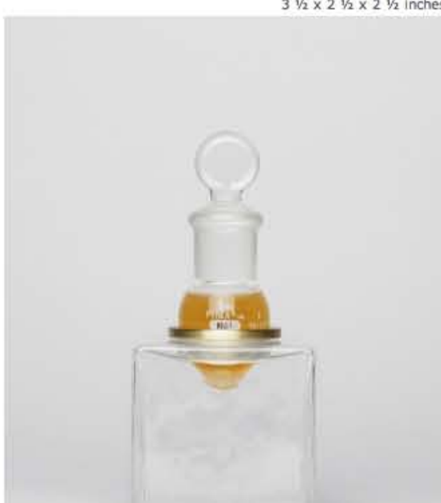
Night Shirt #1 (NS1), 2011 collected from cotton t-shirt worn to sleep for 5 nights between 08.06.11 – 08.11.11, (MC 16-21) sweat essence, glass, brass 3 x 2 x 2 inches